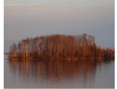
Lac LaRonge, May 2007.