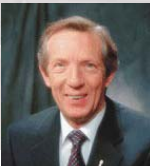
Lorne Calvert, Premier of Saskatchewan