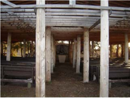
Photograph of the Grotto near the beach in Ile a la Crosse

GDI is currently in a five year contract (December 1, 2003 – November 30, 2008) with the Province for the provision of educational, research, and resource services to Métis people in Saskatchewan. This contract is the first longer-term contract that the Institute has held with the province – former contracts having been on a year-to-year basis. One of the stipulations of this contract calls for evaluation of GDI activities funded by provincial grants. As such, the Institute has established an Evaluation Working Group. An equal number of representatives from both the Institute and the Department of Advanced Education and Employment (AEE) sit on the Working Group. AEE in partnership with GDI is undertaking this evaluation to assess the effectiveness and impacts